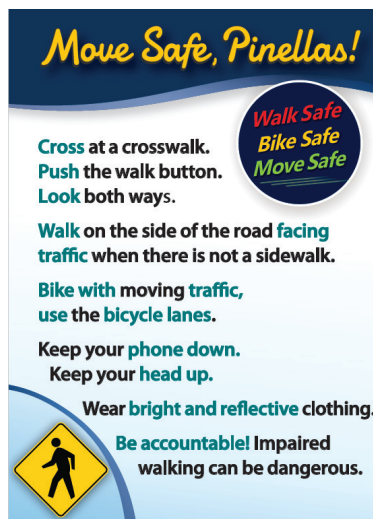
Example of education materials.

Thousands of individuals in Florida rely on biking or walking as their primary transportation option. Florida is also ranked as one of the top states in the nation for the highest number of bicyclist- and pedestrian-related crashes and fatalities. Move Safe, Pinellas looks beyond engineering solutions and supports the education component of the 4 E's of highway safety by influencing behavior changes and encouraging good habits in multimodal road users, specifically bicyclists and pedestrians.