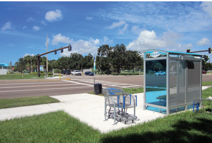
New crosswalk and bus stop make shopping access easier.

Coordination of this work was initially between District Seven Traffic Operations and the City of St. Petersburg; PSTA and FDOT Pinellas Operations were also brought in to assist in a joint project to get the work accomplished. Following coordination efforts between all parties, Traffic Operations developed the design plans and purchased the new pedestrian signal materials, Pinellas Operations' Asset Maintenance Contractor performed all concrete and sod-related work, PSTA installed the new bus stop, and the City of St. Petersburg constructed the new pedestrian signals and pavement markings to round out construction. The initial crosswalk inquiry to FDOT occurred in September 2020. Due to swift coordination between the necessary parties, the plan was finalized April 2021 and the work was completed in July 2021.