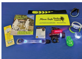
Safety items distributed to the public.

The Move Safe, Pinellas multimodal safety and education program aims to enhance bicyclist and pedestrian safety and reduce the occurrence of related crashes and fatalities in Pinellas County, Florida. Since 2018, the award-winning safety program has educated thousands of individuals through its extensive community outreach and distribution of safety devices. The program partners with human services agencies, the sheriff's office, and the school district, among other community groups, to directly reach what has been identified as the county's most vulnerable road users. This includes at-risk individuals who experience substance abuse or homelessness, low-income residents who are limited in their transportation options, and grade school students who walk or bike to school.