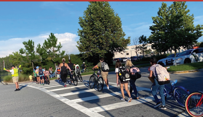
Crossing guard assists students in crosswalk near the new Starkey Ranch School (K-8) in Pasco County.