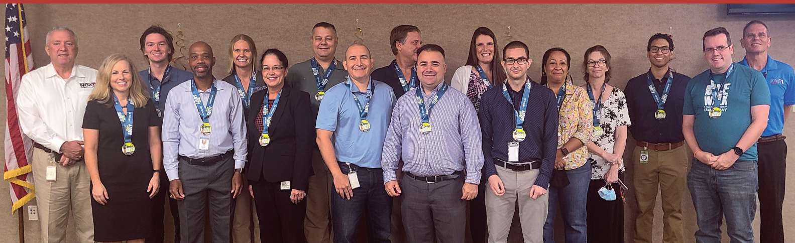
FDOT and University of South Florida pilot participants who completed the 5K challenge pose at medal ceremony.